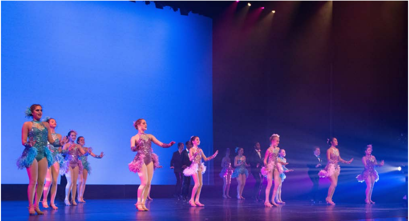
Tap IV, V, VI