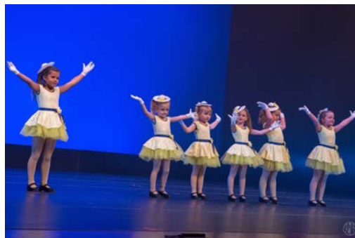
Tap for 4's & 5's, "Messages"