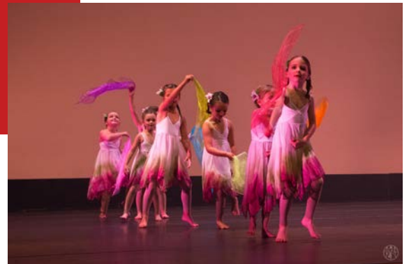
Foundations of Dance

A student may expect to spend 1-3 years in each level.