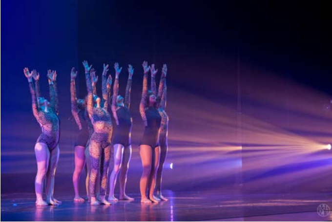
Modern V/VI “Messages”

Boys: Solid color fitted t-shirt, black tights, shorts, or dance pants.